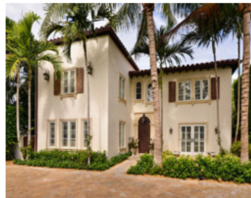
PALM BEACH, FL | $4,950,000 Charming Renovated Mediterranean In Town

AMY ALCINI | 310.457.2534 CORMAC O'HERLIHY | 310.457.2534