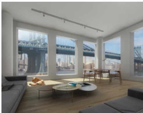
BROOKLYN, NY | $5,214,773 1 John Street